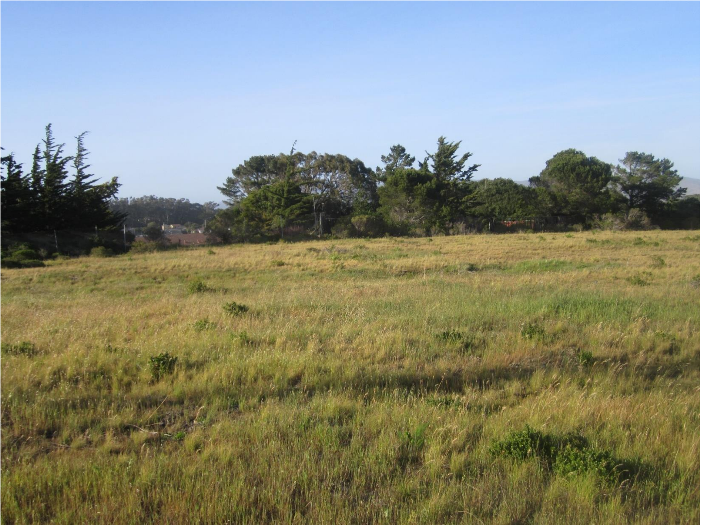
Attachment 11: Photographs