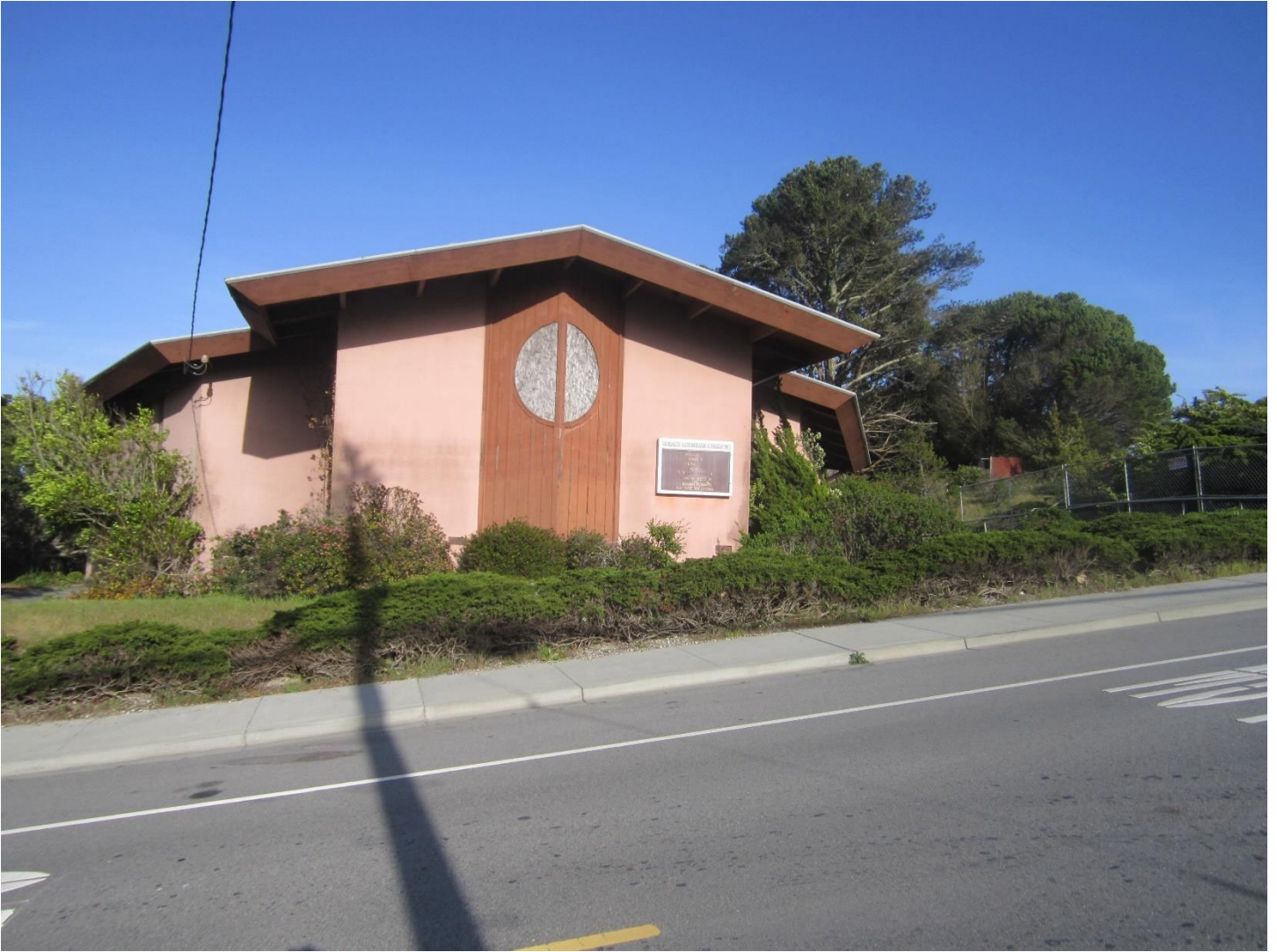
Attachment 11: Photographs