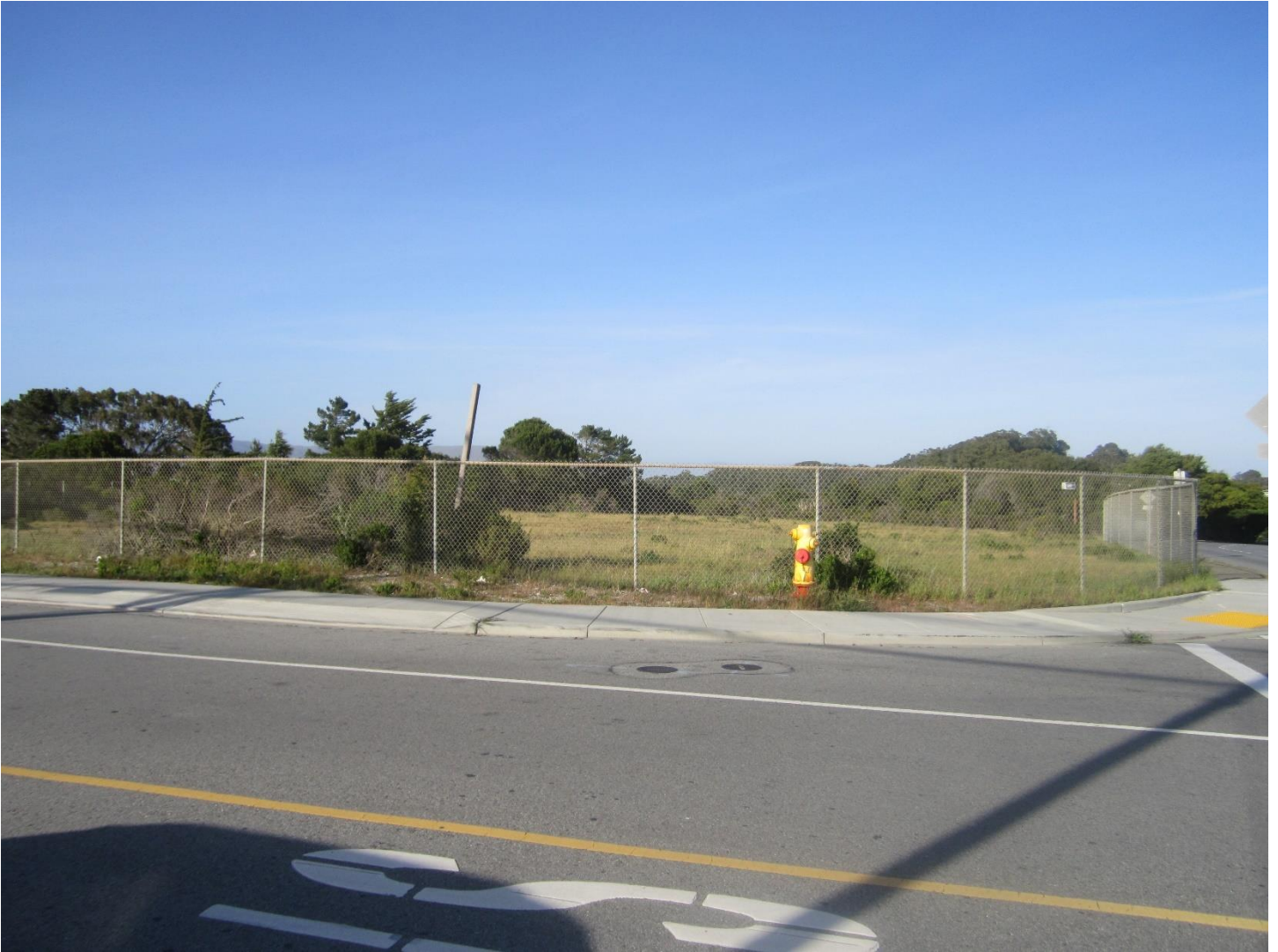
Attachment 11: Photographs

Subject Property (looking NE from the corner Glenview Drive and San Bruno Ave.)