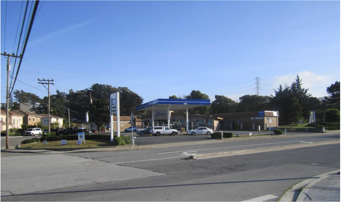
Attachment 11: Photographs