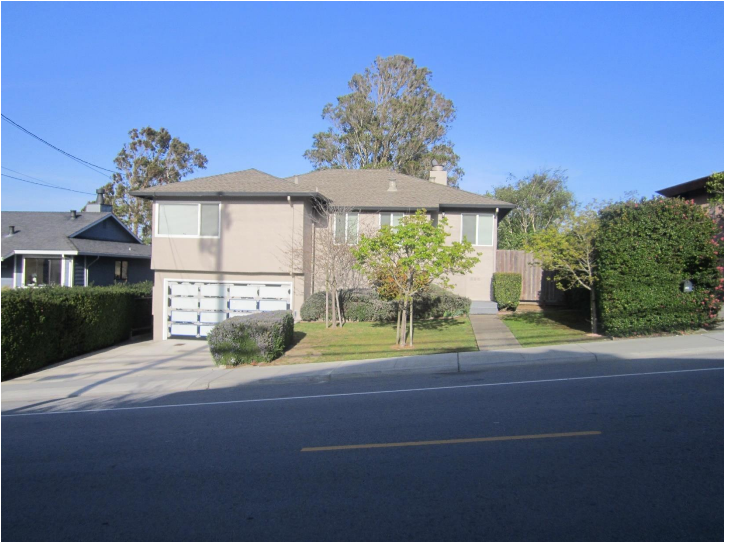
Attachment 11: Photographs