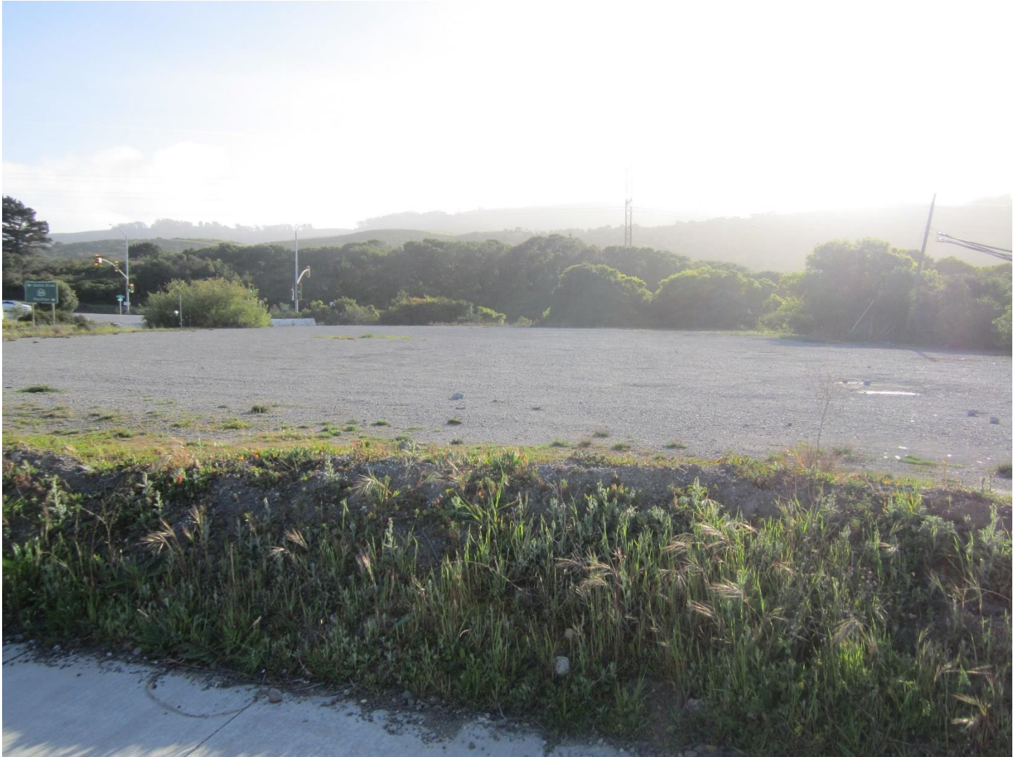
Attachment 11: Photographs