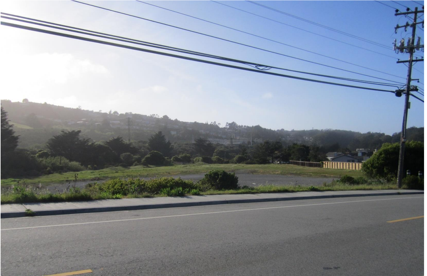
Attachment 11: Photographs